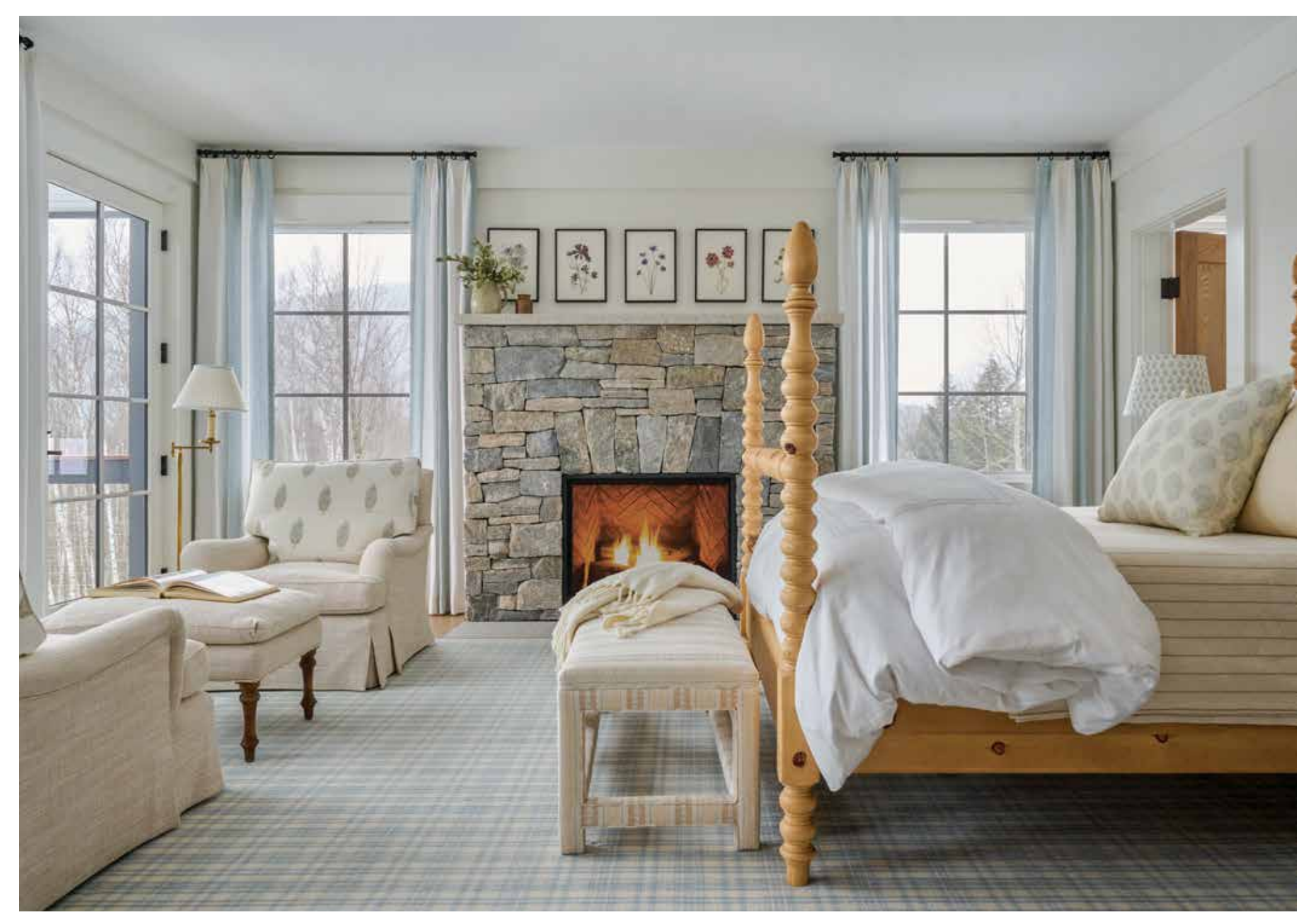
CLOCKWISE FROM ABOVE: Soft colors and plush textures define the primary bedroom; Marment chose the pressed-flower botanicals above the mantel because, she says, "they balance the heft of the fireplace." Pristine white Thassos marble tops the bathroom's vanity. Sister Parish's Sintra grasscloth wraps the walls of the primary bath.

ARCHITECTURE: ERG Architect INTERIOR DESIGN: Ellen Marment Interiors BUILDER: Trumbull-Nelson Construction Company